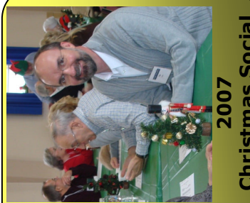
2007 Christmas Social